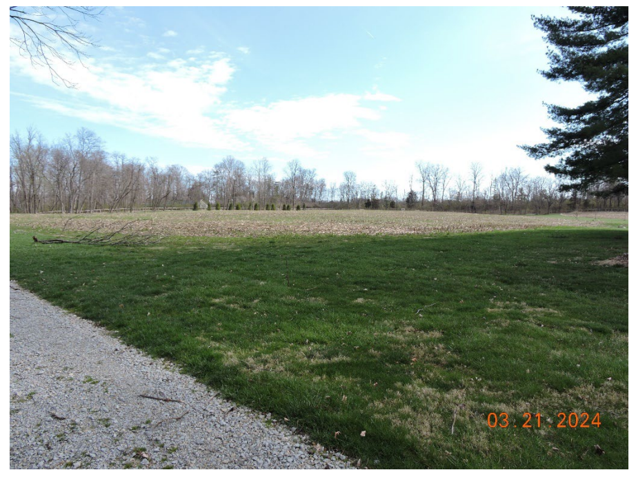
View from shared driveway looking northeast at proposed Lot B.

View from shared driveway looking north at proposed Lot B.