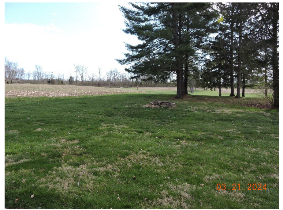
View from shared driveway looking east at approximate location of 1520' handle length.

View from shared driveway looking south from approximate location of 1520' handle length.